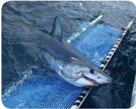
Shortfin Mako, captured off the South East of South Australia, to be fitted with a fin mounted satellite tag.

The impressive Shortfin Mako, Isurus oxyrinchus (family Lamnidae), listed as vulnerable by the International Union of Conservation of Nature (IUCN) and the Convention of Migratory Species (CMS), are a prized catch for recreational, game and charter fishers. Incidental captures also occur by fishers targeting other species and as by-catch by commercial fisheries.