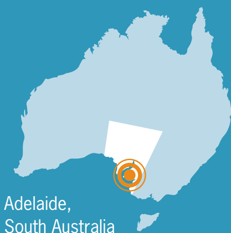
Adelaide, South Australia

Rural Solutions SA 1300 364 322 www.ruralsolutions.sa.gov.au info@ruralsolutions.sa.gov.au