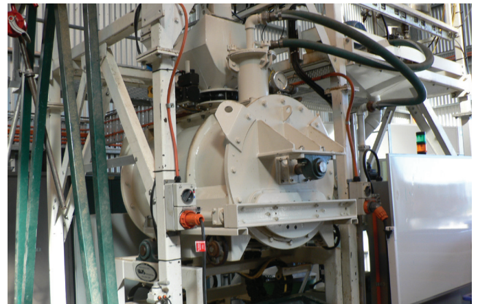
Above: UAS vacuum infusion system